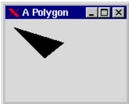
Figure 8.10: Canvas Polygon Object

gs:create(polygon,Canvas, [{coords, [{10,10},{50,50},{75,30}]}]).